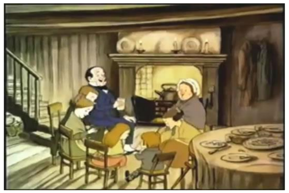
The family was poor but loved each other and enjoyed Christmas. It didn't matter that they had no gifts or tree.